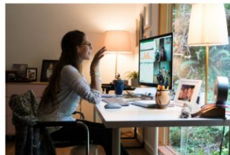
CONNECTING WITH STUDENTS AND PARENTS >