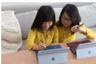
DATA COLLECTION >