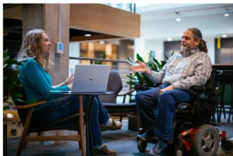
TEACHERS AS CONSULTANTS >

Remote learning and the use of technology has opened up opportunities for teachers to try new ways of providing services, collection data and connecting with students and families. Utilizing these familiar tools for a remote environment can be a powerful step toward reaching learning goals.