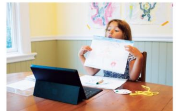
MODELS OF INSTRUCTION >