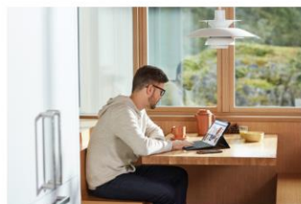
SETTING YOURSELF UP FOR SUCCESS >