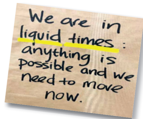
CAFÉ: A once-in-a-lifetime opportunity to reimagine education and to consider Ireland’s education needs.