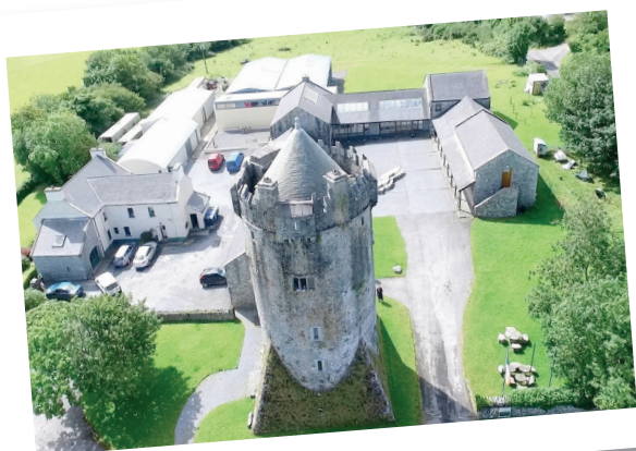
Burren College of Art