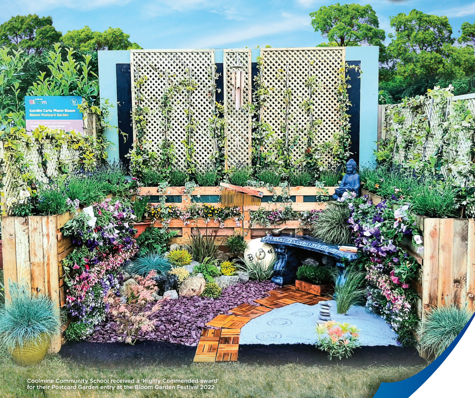
Coolmine Community School received a 'Highly Commended award' for their Postcard Garden entry at the Bloom Garden Festival 2022

IN THIS ISSUE • Welcome to the 2022/2023 school year • Continuous Professional Development pull-out supplement • Retirees 2022 • Citizens Assembly