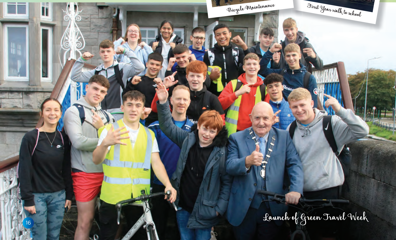
Launch of Green Travel Week