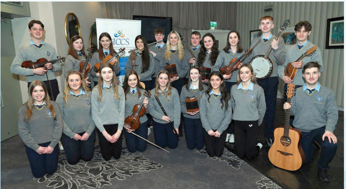
Tarbert Comprehensive School students