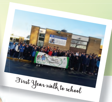
First Year walk to school