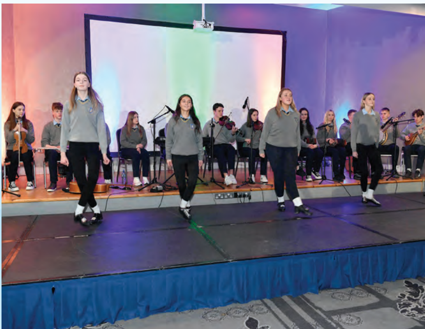
Tarbert Comprehensive School students perform at convention