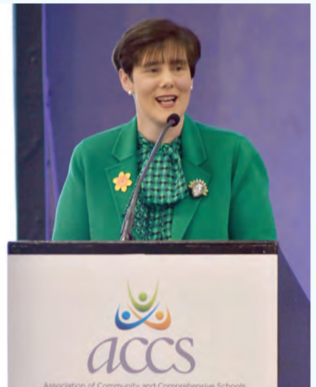
Minister for Education, Ms. Norma Foley