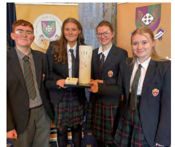
Members of the Senior Public Speaking team with the Connacht Final Trophy