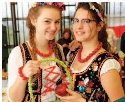
Food Fair at Multicultural Day in St. Kilian's Community School.